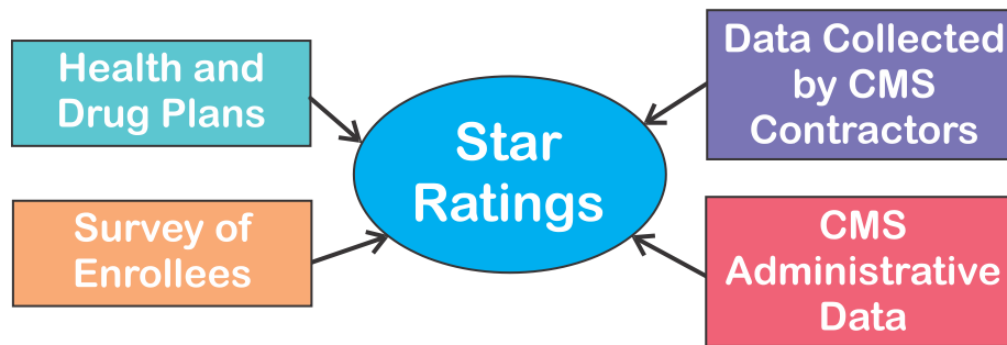
Figure 2: The Four Categories of Data Sources