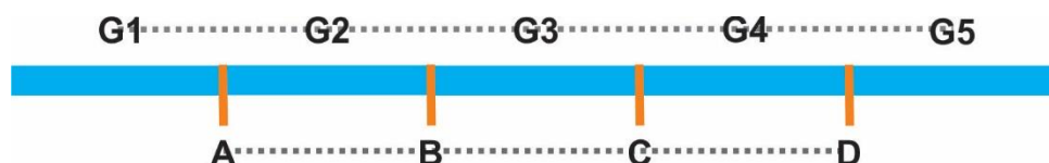
Figure J-1: Diagram showing gaps in data where cut points are assigned

As mentioned, the cut points are used to create five non-overlapping groups. The value of the lower bound for each group is included in the category, while the value of the upper bound is not included in the category. CMS does not require the same number of observations (contracts) within each group. The groups are identified such that within a group the measure scores must be similar to each other and between groups, the measure scores in one group are not similar to measures scores in another group. The groups are then used for the conversion of the measure scores to one of five Star Ratings categories. For most measures, a higher score is better, and thus, the group with the highest range of measure scores is converted to a rating of five stars. An example of a measure for which higher is better is Medication Adherence for Diabetes Medications . For some measures a lower score is better, and thus, the group with the lowest range of measures scores is converted to a rating of five stars. An example of a measure for which a lower score is better is Members Choosing to Leave the Plan .