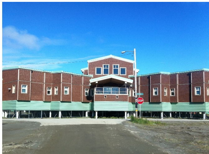
Utuqqanaat Inaat Nursing Home

The nursing home employs an Iñupiat language speaker to ensure residents can communicate in their traditional language, if desired. With the help of a local translator, the nursing home produced Iñupiat language versions of the resident rights document and the resident handbook. The documents were also translated into braille for visually impaired elders. Additionally, the nursing home developed a small Iñupiat language dictionary to help staff interact with residents using common Iñupiat words and phrases.