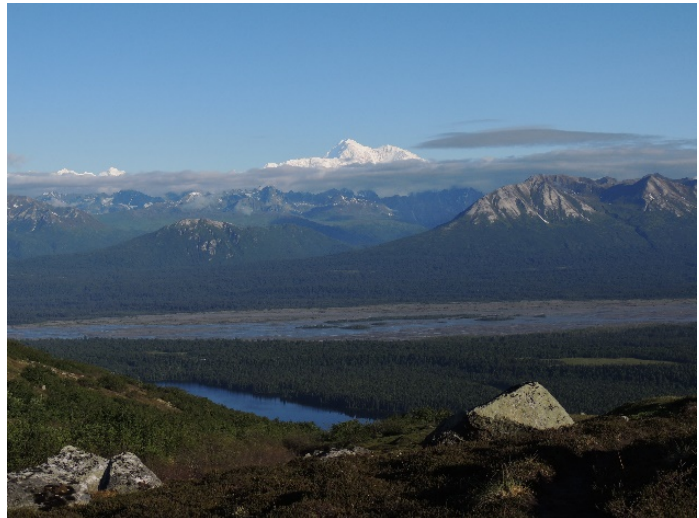
Surrounding landscape near the Yukon Kuskokwim Elders Home

Whenever possible, the nursing home hires staff from the same culture as the residents, so the elders can speak and be understood in their traditional language. The nursing home manages staff schedules to ensure a Yupik speaker is available on every shift. Further, interpreters are always available during resident council meetings, so all elders can participate.