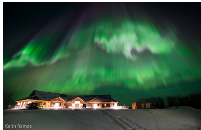
Yukon Koyukuk Elder Assisted Living Facility

While most of the residents at Yukon Koyukuk Elder Assisted Living Facility speak English, their traditional language is an important link to their culture. Staff who do not speak Athabascan learn how to exchange common phrases with residents and ask questions in their native language. The assisted living home reminds staff and care providers who visit the facility about culturally appropriate communication styles, such as sensitivity to eye contact. They also learn how to communicate effectively with people who have dementia by slowing down the pace of interactions and being comfortable with moments of silence.